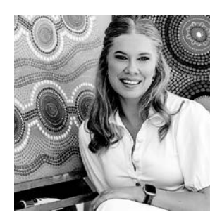
ARTIST DOMICA HILL